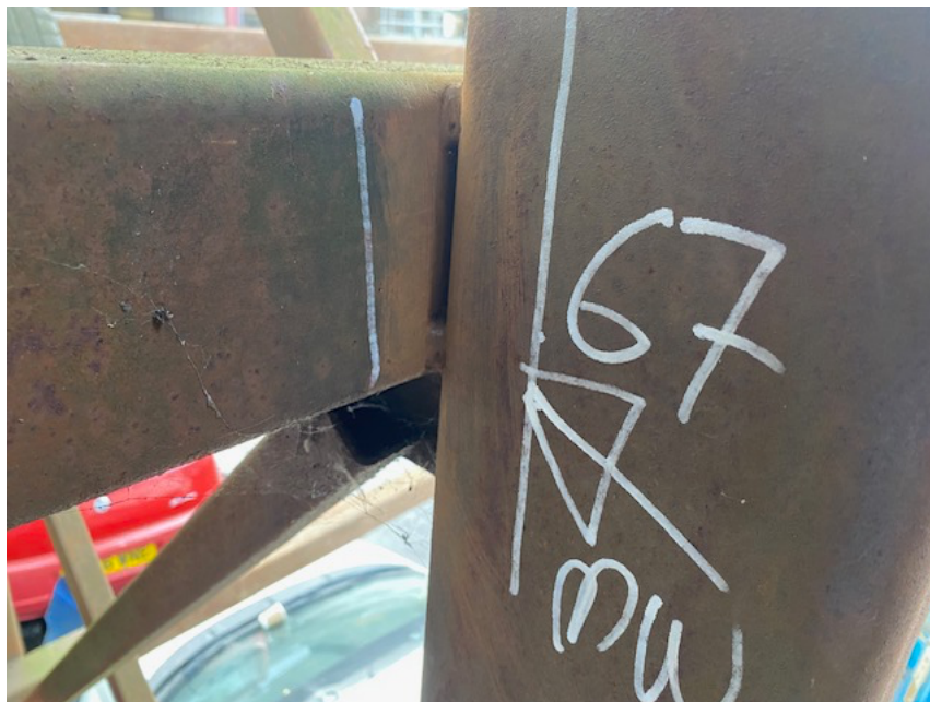
R67, Missing weld