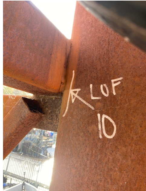
R10, Lack of side wall fusion