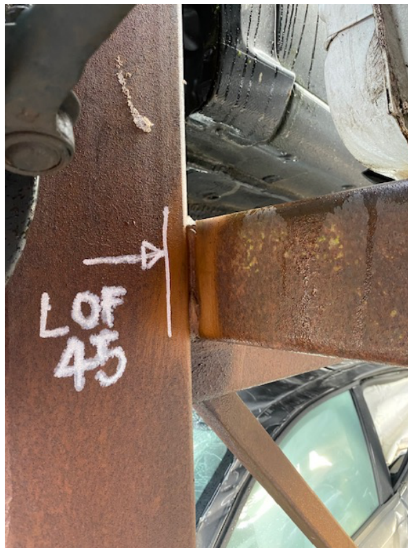
R45, Lack of sidewall fusion