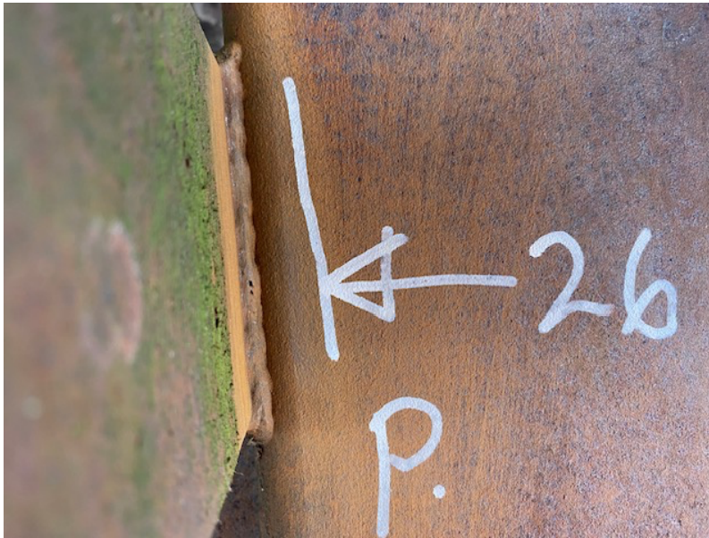
R26, Cluster porosity