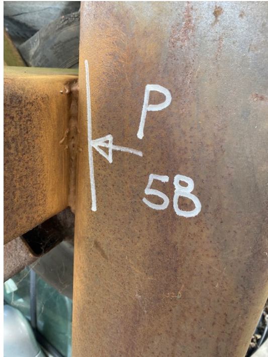
R58, Cluster porosity