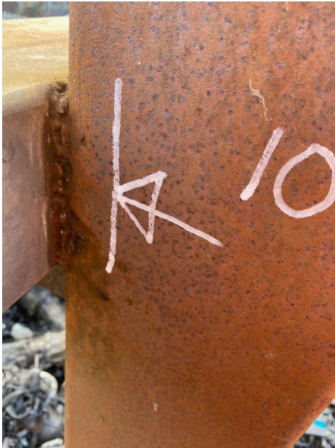
R10, Weld bead not acceptable