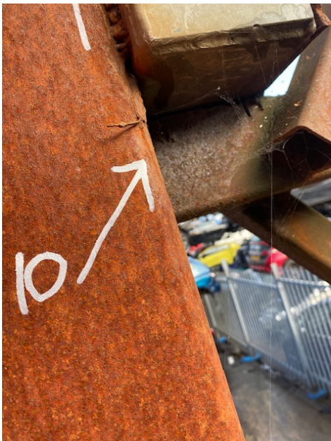
R10, Weld bead not acceptable