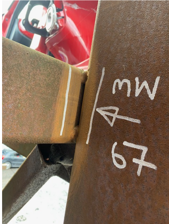
R67, Missing weld